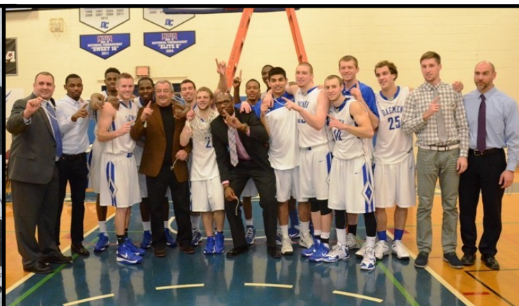
2013-14 Team: ECC Regular Season Champs