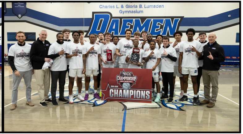
2025-26 Team: ECC Regular Season & Tournament Champions