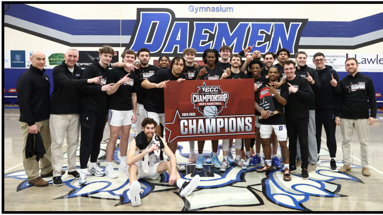
2024-25 Team: ECC Regular Season & Tournament Champions